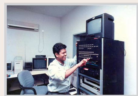
Fixing Editing system (AVID), Cabling & making the Patch Panel in the first "Swarnavahini" studio, Sri Lanka.