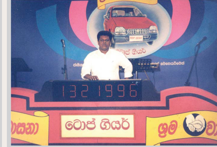
Designed & made a lottery draw machine for the National Lotteries Board (www.nlb.lk), Sri Lanka.